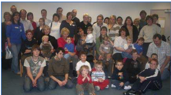
Families, medical staff and helpers at a UK clinic

We are unique in being able to offer you information based on 10 years of research, experience and observations by scientists, doctors and parents.